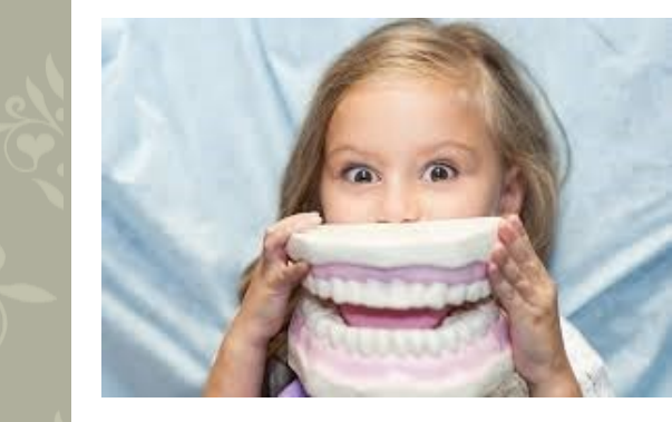
Assess Redefine Manage – Educate and then Review : Repeat : Restore: Rehabilitate : Re-establish