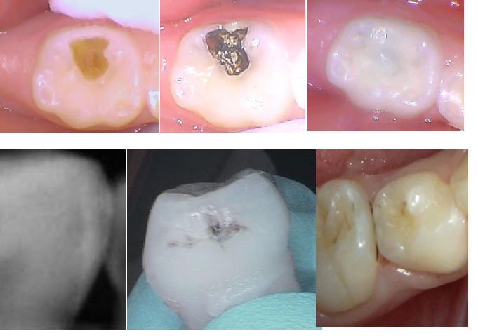
Silver fluoride for prevention– assess and control early decay between teeth before a filling is needed.

5 yr old. 1st visit –silver fluoride placed on active decay Visit 2– decay is no longer active and tooth easily filled.